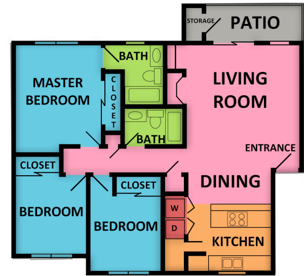
3 Bedroom | 2 Bath